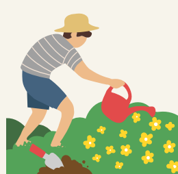
WORKING ON A PROJECT

To channel anxious thoughts or feelings in more productive ways, we might identify specific outlets to express creativity, such as working on a project, drawing, and athletics.